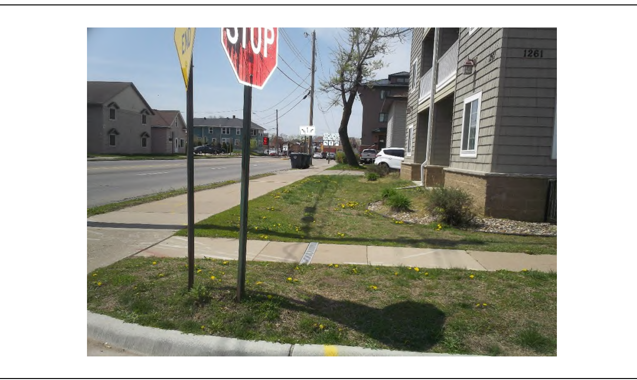
Easement Area Along STH 16/La Crosse Street Camera Pointed West