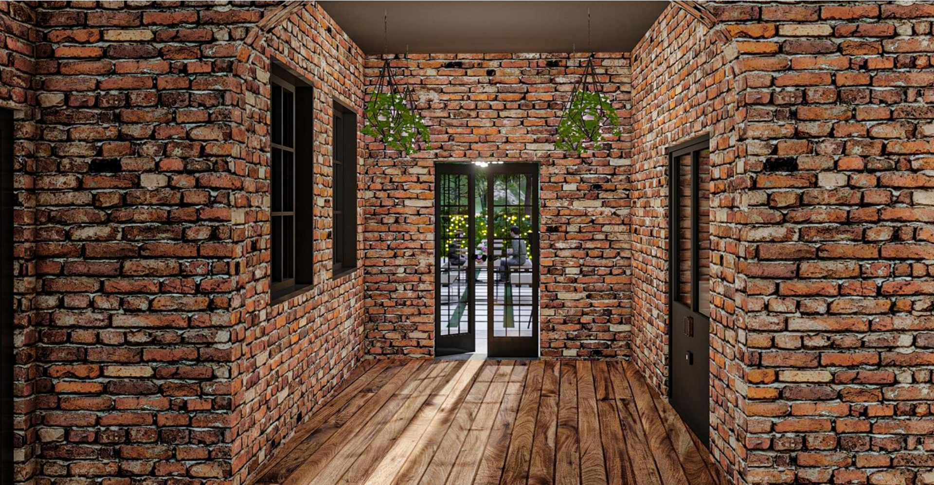
Entrance from East Outdoor Garden Patio - Currently a parking lot