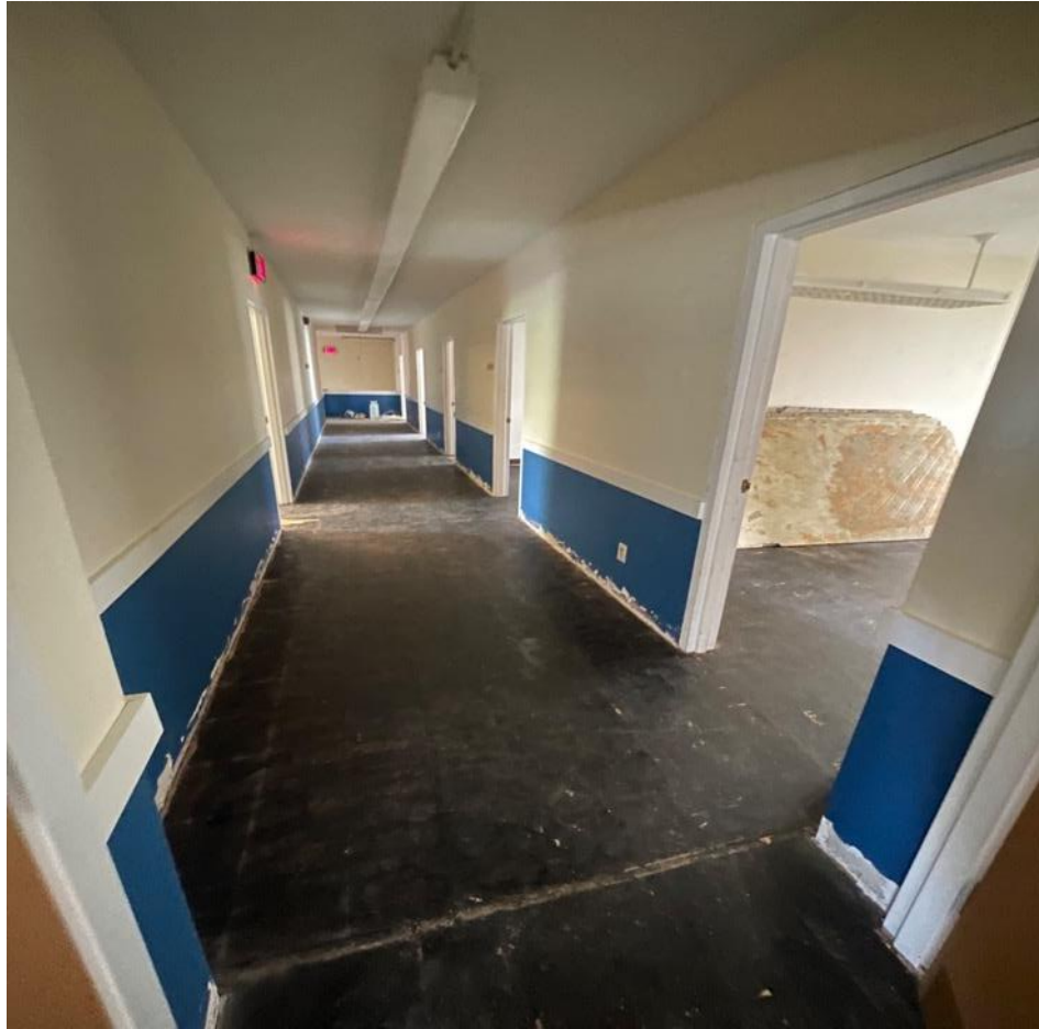
Current Main Hallway - Layout cannot be altered due to historical registry