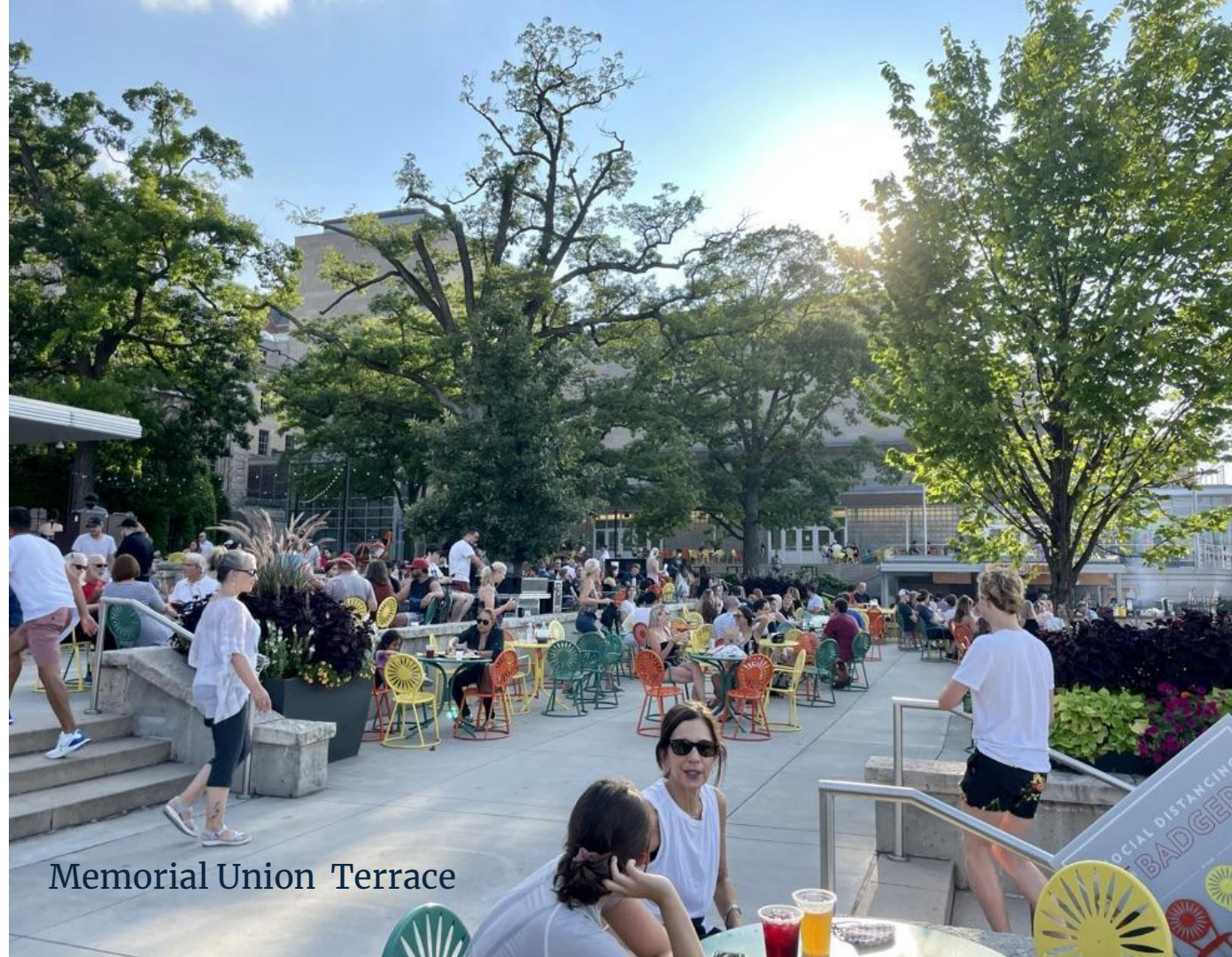
Memorial Union Terrace

Estimated Private Build Out Costs: $200,000