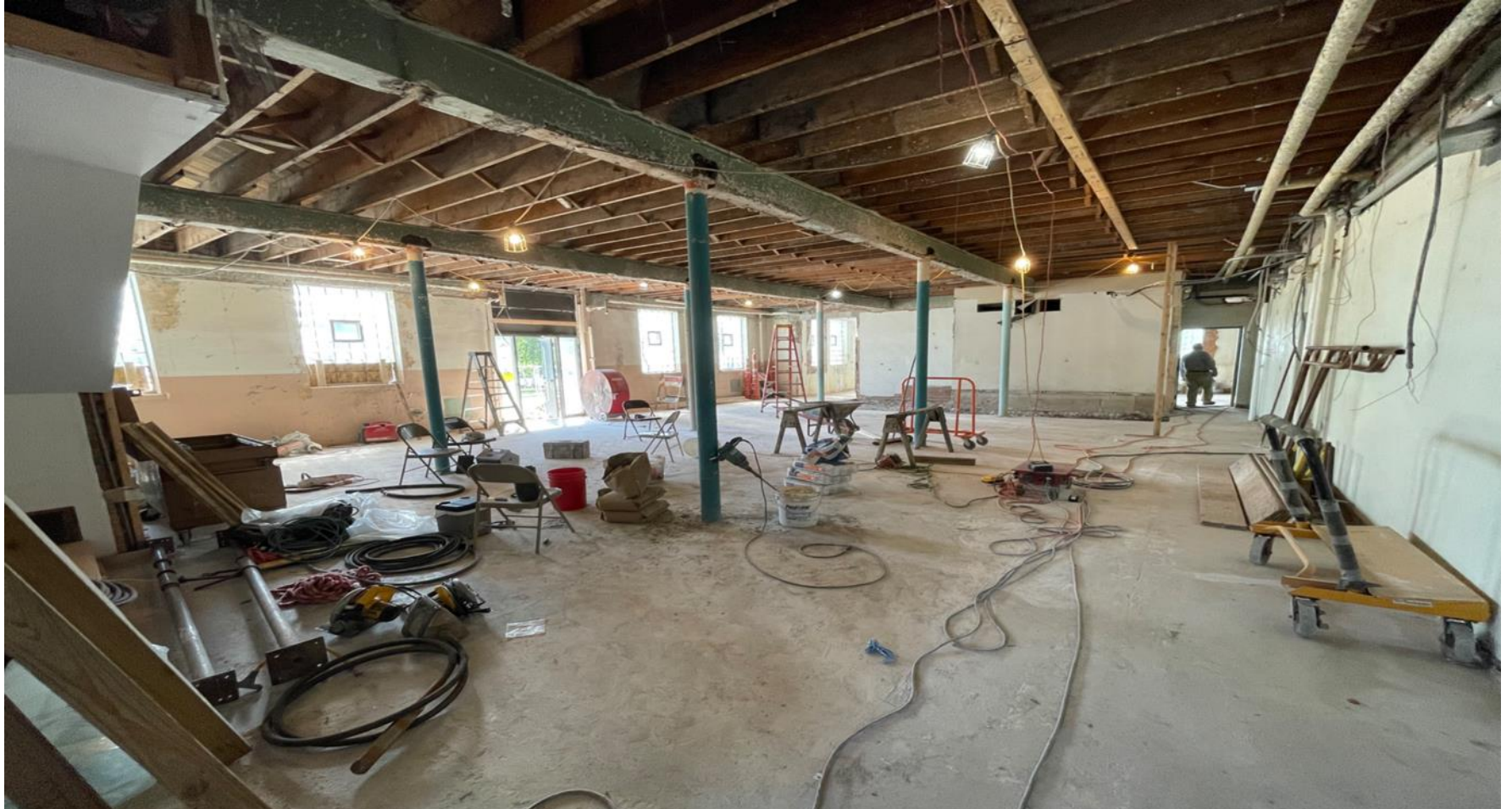
Main Multi Purpose Space – inside main building