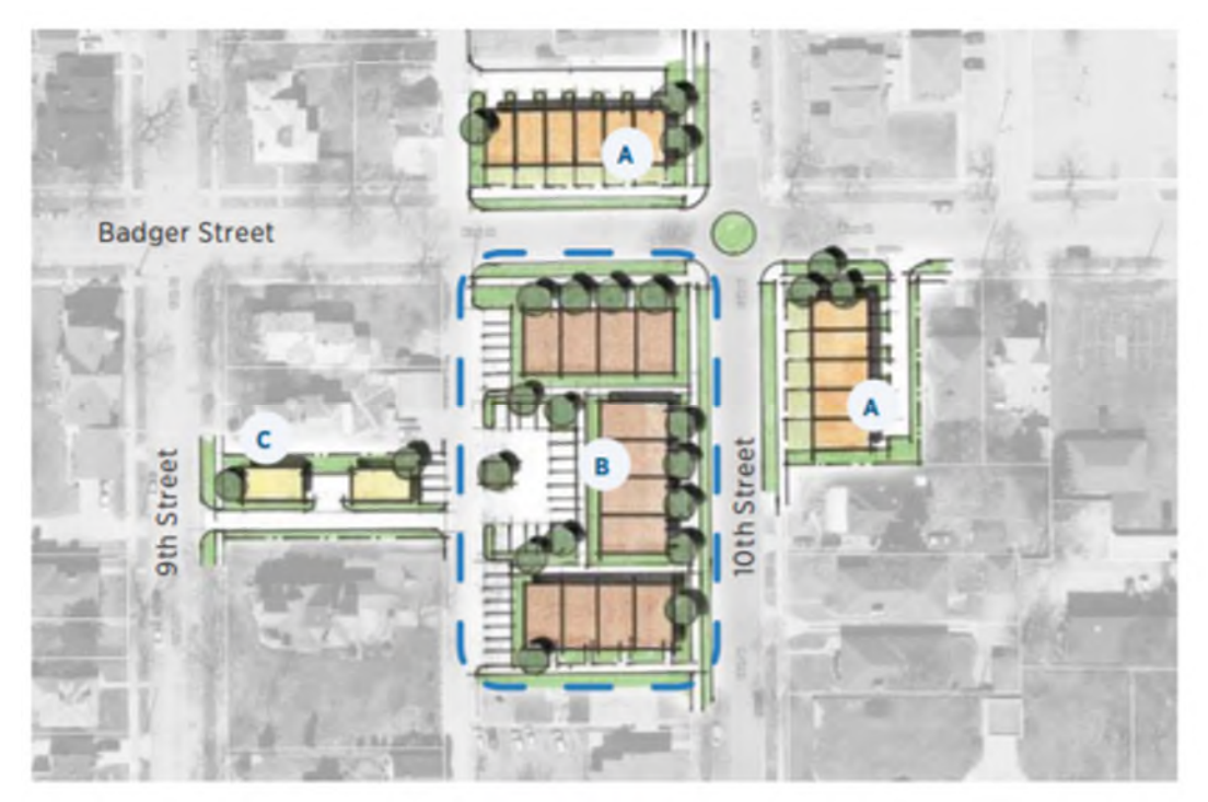
Figure 1 Imagine 2040 Plan pg. 64

The recently completed Imagine 2040 plan, that includes the Washburn, Downtown and Goosetown Neighborhoods recommends townhomes at 1106-08 King St. site (Figure 1) at a density of 14 units per acre(Figure 2).