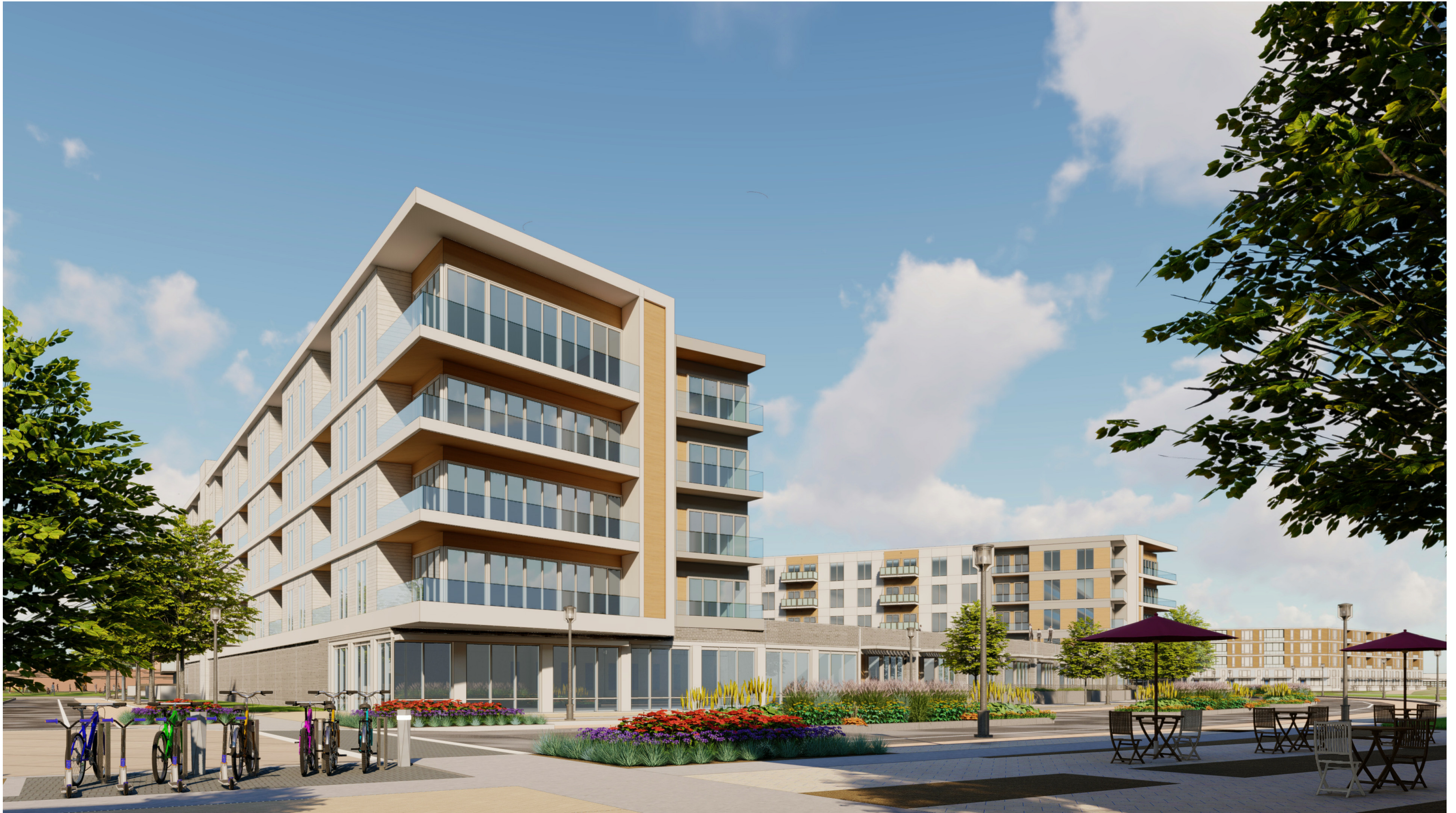
CONCEPT RENDER - CORNER VIEW