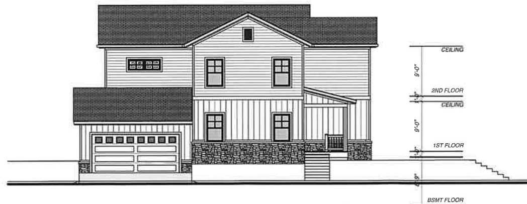
3 A2 KING STREET ELEVATION SCALE: 1/8" = 1'-0"