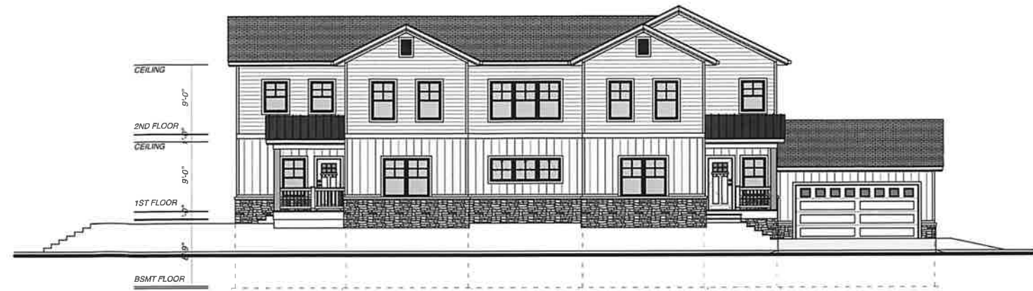
2 A2 11TH STREET ELEVATION SCALE: 1/8" = 1'-0"