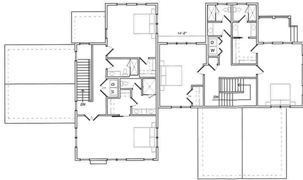
2 2ND FLOOR PLAN A1 SCALE: 1/8" = 1'-0"