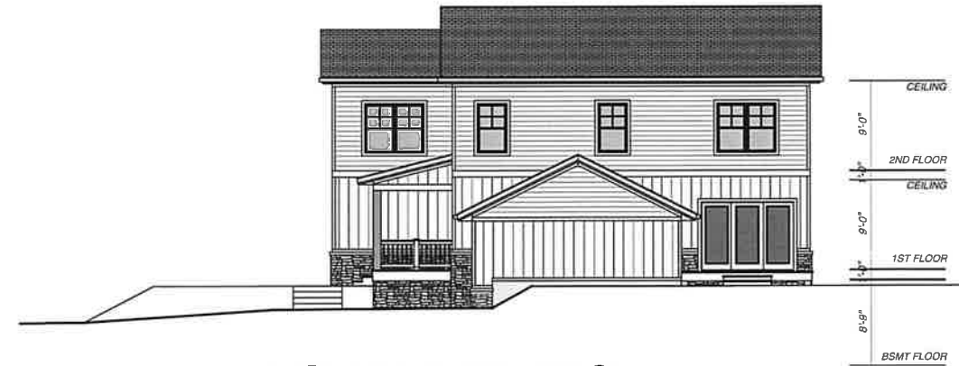
4 A2 SOUTH ELEVATION SCALE: 1/8" = 1'-0"

CHRIS L. SHORNE ARCHITECTURE 425 28TH STREET, LA CROSSE, WI 54601 (608) 785-2626 Email: clashorne@gmail.com Architectural and Design for Residential, Commercial, Historic Rehabilitation