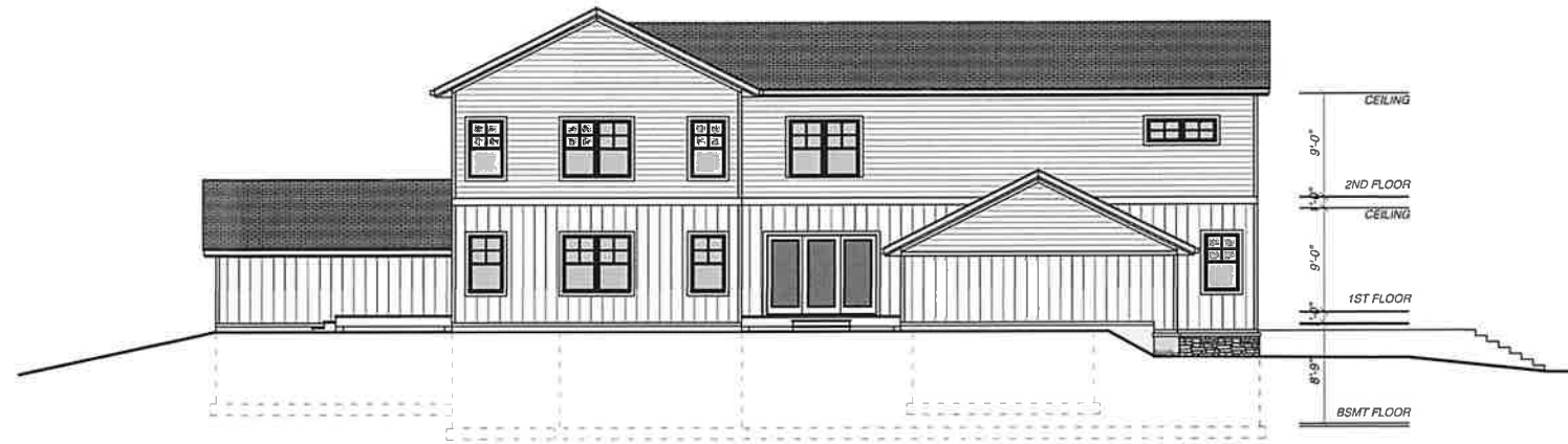
3 A2 EAST ELEVATION SCALE: 1/8" = 1'-0"