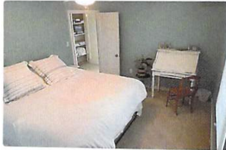
Bedroom 1 1 king bed