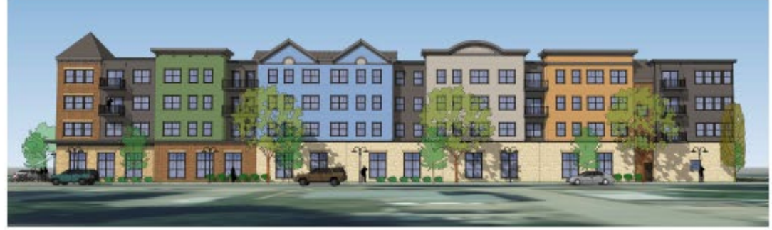
10TH STREET ELEVATION