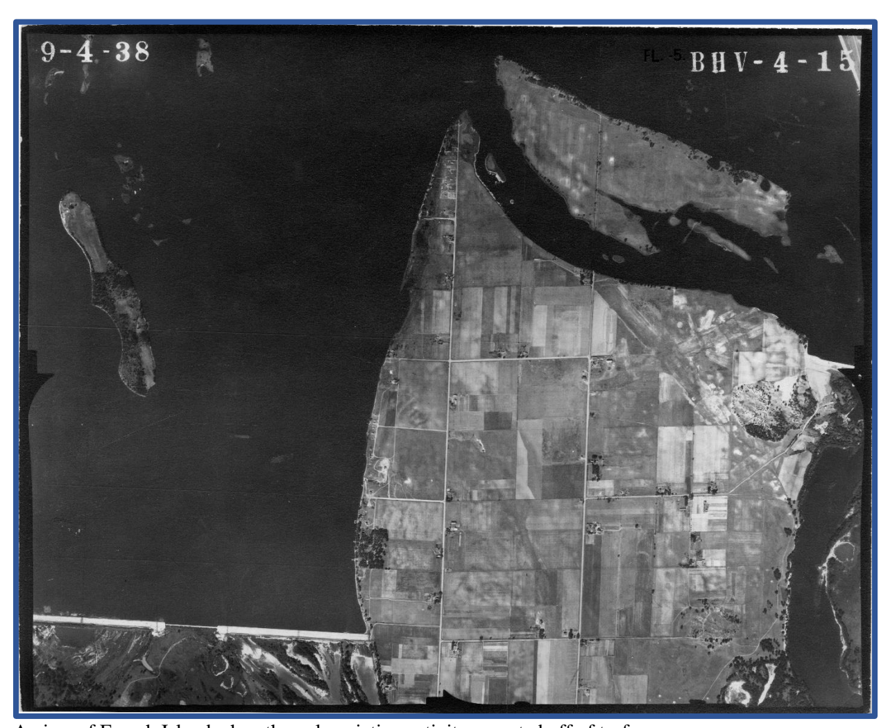
A view of French Island when the only aviation activity operated off of turf.